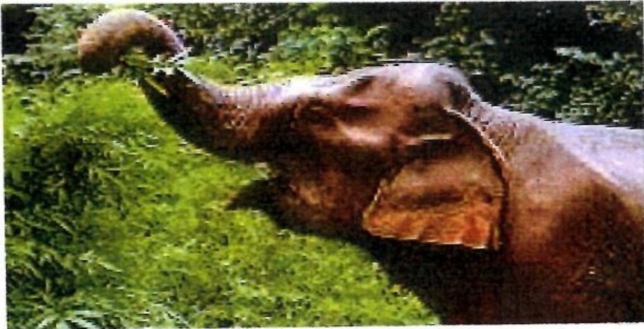
An Elephant eating leaves.

Elephants eat lots of vegetation like roots, grass, fruit and bark.